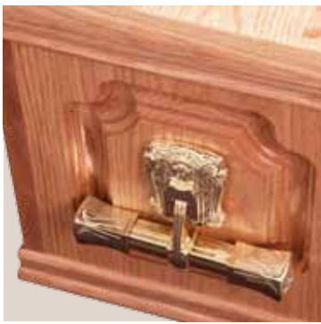
Butt joint ends